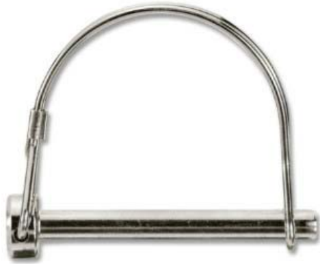
ROUND WIRE LOCK PIN