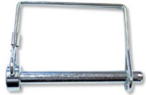
SQUARE WIRE LOCK PIN