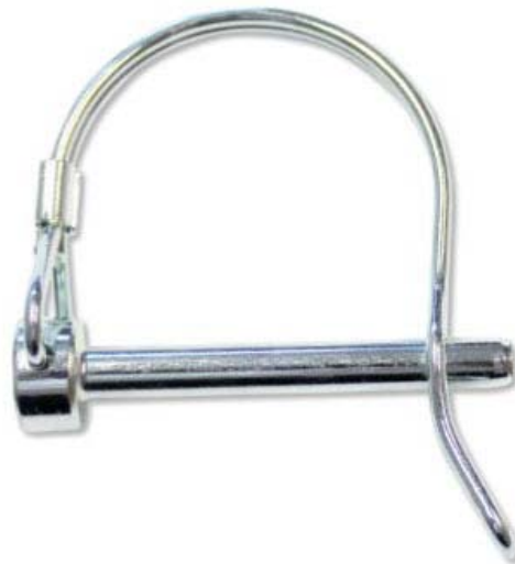
ROUND TAB LOCK PIN