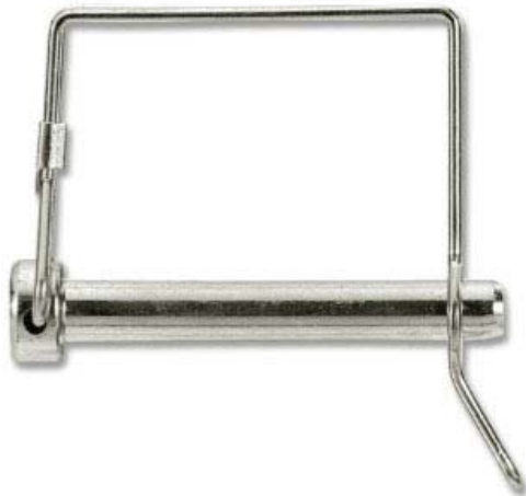
SQUARE TAB LOCK PIN